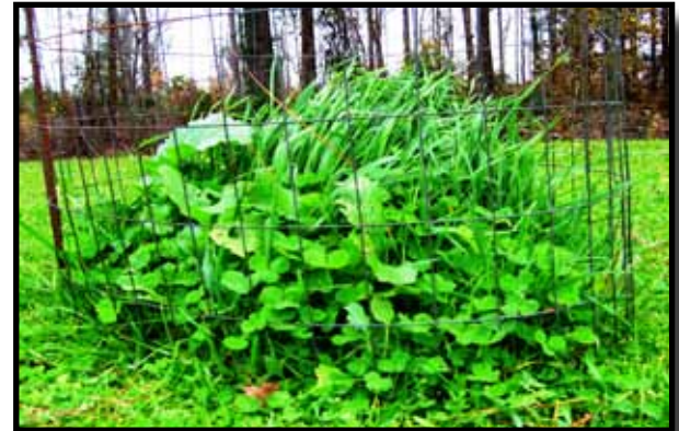
With a combination of small grains, brassica, winter peas and clovers, BUCKMASTERS Feeding Frenzy provides nutrition deer need and desire.

Feeding Frenzy is a combination of small grains, brassicas, sweet winter peas and clovers specifically formulated in the precise percentages to ensure that deer are attracted to and can utilize each plot to its maximum nutritional potential. This mixture remains attractive every week of the season to consistently bring deer into the food plot. The oats in the mixture germinate first and quickly grow to lure deer into the food plot. Sweet winter peas then establish to provide a source of high protein and desirable forage. As winter arrives, the carbohydrates in the brassica leaves are converted to sugars, making the plants highly palatable and providing energy and nutrition during the coldest months following the rut. The clovers grow throughout the winter into spring providing high quality nutrition for post-rut bucks and pregnant does.