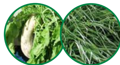
Root Plow™ Radish ryegrass

This mixture contains Root Plow radish and Pennington ARG-1. Root Plow radish is a seriously deep rooted plant that breaks up hard packed soil and creates pores for water and air. It is mixed with our proprietary ryegrass, ARG-1, our best extended root variety to add even more root penetrating capability to this mix. ARG-1 has excellent winter hardiness and is a uniform and late maturing variety for a longer termination window. Plant this product at ½” depth at a rate of 12.5 lbs/acre.