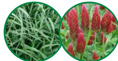
rye crimson clover

This mixture contains Wintergrazer 70 rye and AU Sunrise crimson clover. Wintergrazer 70 can scavenge up to 100 lbs/A of nitrogen from the previous cash crop and AU Sunrise will also scavenge excess nutrients while producing up to 75 lbs/A of nitrogen. Together these two cover crops enrich the soil with nitrogen and other nutrients while increasing soil tilth for the next cash crop. Plant this product at ½” depth at a rate of 50 lbs/acre.