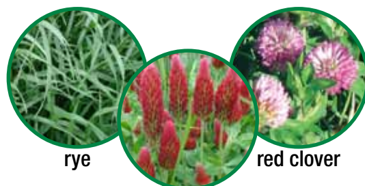
rye crimson clover red clover

This mixture contains Wintergrazer 70 Rye, AU Sunrise Crimson Clover and red clover. Our YieldUp mix gives you all the benefits of our Cover Star All Purpose Mixture plus the added boost of nitrogen from the top N producing red clover plant. The crimson and red clovers work overtime to add nitrogen to your soil, reducing input costs and providing superior yield results. YieldUp Cover Crop mix will fix up to 125 lbs per acre of free nitrogen. Plant at ½” depth at a rate of 50 lbs/acre.