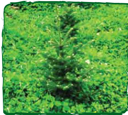
The basic concept of the IPM groundcover management system is to establish and maintain sustainable and low maintenance ground cover.

When compared to other clovers, Durana is more heat and drought tolerant and exhibits better insect and disease resistance. It is tolerant of poor soils with low fertility and low pH. Once established, it has also proven to tolerate the low glyphosate rates that are being used in this groundcover management protocol. Durana forms a thick, water penetrable mat that suppresses undesirable weeds and holds highly erodible soils in place. It spreads across the top of the ground, covering open surfaces to provide 100% ground cover.