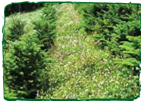
Intermediate white clover forms a thick, water penetrable mat that suppresses weeds and holds soil in place.

As a legume, Durana improves soil structure and captures up to 150 lbs. of atmospheric nitrogen per acre annually which it shares with companion plants – another plus adds Davis, "We will be reducing the amount of nitrogen we apply which will result in big cost savings."