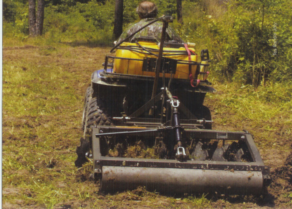
Kendall Lee, president of Wildlife Specialty, Inc. uses the BrushMaster ( www.amcomfg.com ) and ATV to prepare roadside for planting and dusting areas.

Another way to create feeding lanes in mature crop pines without burning can be accomplished with a late summer application